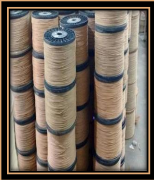
SIZE-0.81MM TO 3MM