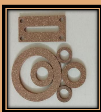
AS PER YOUR REQUIREMENT