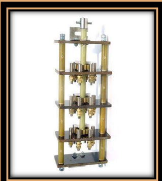
11KV (30A, 60A, 100A, 150A) 33KV (30A, 60A, 100A, 150A) 5,7&9 POSITIONS