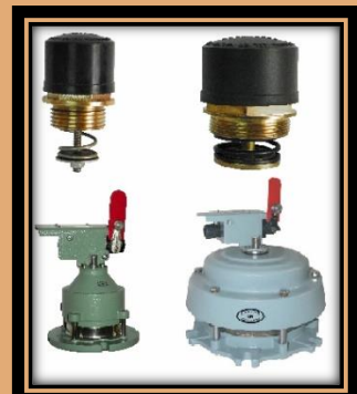
SIZE-1/2" & 3/2" MM