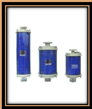
SIZE-250 GRAM TO 5 KGS (ALU. CASTING, CLEAR VIEW, DOUBLE CONTAINER)