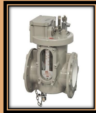
SIZE-184MM, 214MM (GOR I & GOR II)