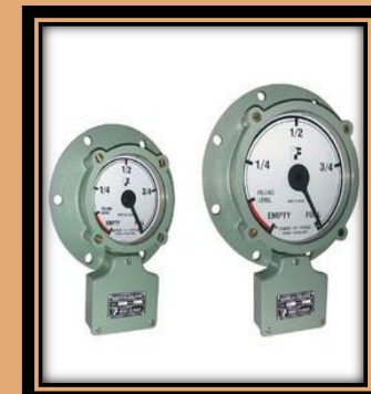
SIZE-100MM & 150MM DIAL