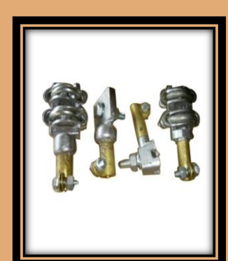
AS PER YOUR REQUIREMENT