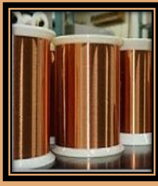
SIZE-0.81MM TO 3MM