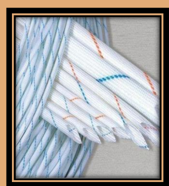
SIZE-1MM TO 12MM