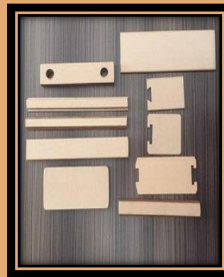
AS PER YOUR REQUIREMENT