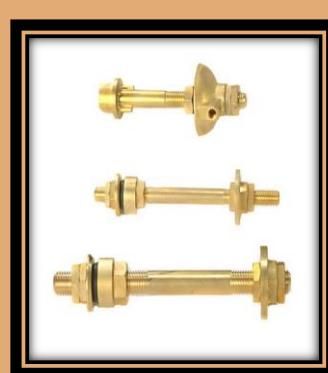
SIZE- 12,20,30,42MM (BRASS)