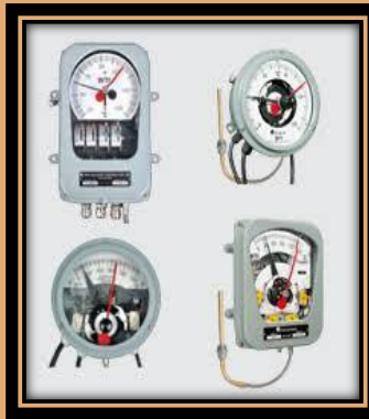
SIZE-4" & 6" DIAL (STEM & CAPILLARY TYPE)