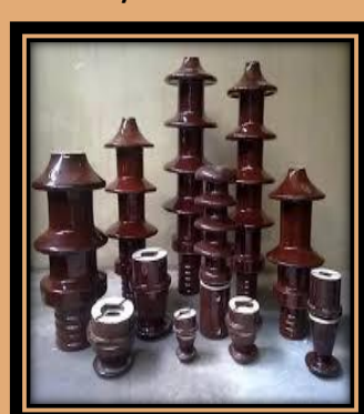
AS PER IS 3347