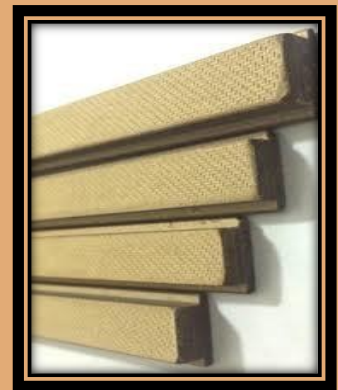
AS PER YOUR REQUIREMENT