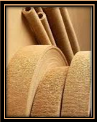
SIZE- 3,4MIL X 25MM