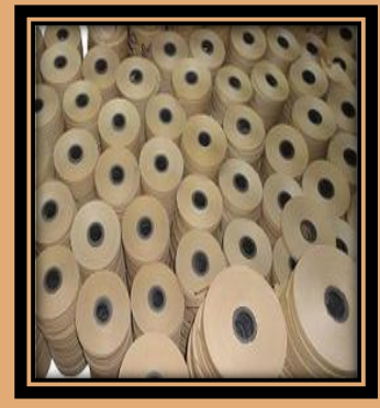
AS PER YOUR REQUIREMENT