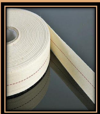
SIZE-25MM X 30,35,40MTR