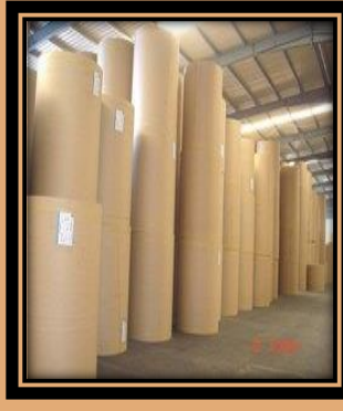
SIZE-1.5MIL TO 20 MIL (ABB, IMPORTED, ELECTRA, KHATIMA)