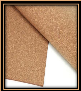
THICKNESS-5MM TO 12MM